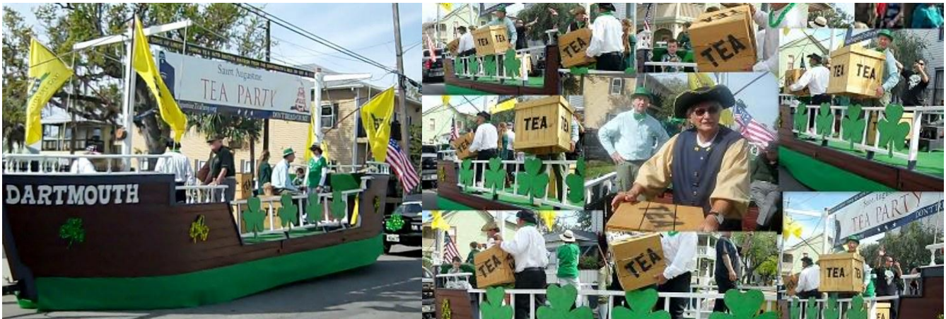
March 10, 2018