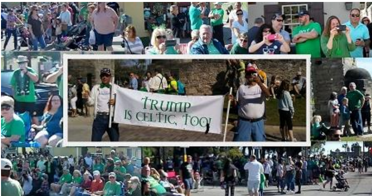
March 9, 2019

their presence that infuriates those that are raging the "Cultural War". The "Progressive Communists" have, for years, conducted their activity from the shadows. Today with the collapse of fake news, new voices are awakening the American people. When the Tea Party is present in a parade, the public's reaction is very positive and receptive.